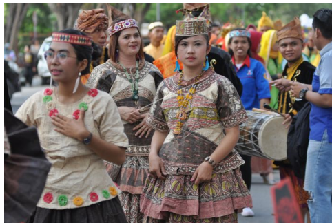
Figure 2 The use of bark cloth in cultural carnivals

Apart from being carried out by the Kaili community, promotional practices are also carried out by the Central Sulawesi government. As a government authority, the Central Sulawesi Provincial Government has political influence in the community and tries to actively promote clothing made from bark cloth. In addition, the Central Sulawesi Provincial Government sees the traditions and uniqueness of local culture as a tourist attraction for local and foreign tourists. Therefore, the government routinely organizes a “cultural carnival” yearly to provide promotional space while introducing it to the younger generation (Figure 2). The cultural carnival accompanies various community entertainments, such as night markets, culinary, musical performances, children’s playgrounds, and traditional handicrafts. One of them showcases the potential of barkcloth clothing as one of the economic drivers for small businesses, home industries, and traditional craftsmen.